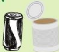
Cans and Tins